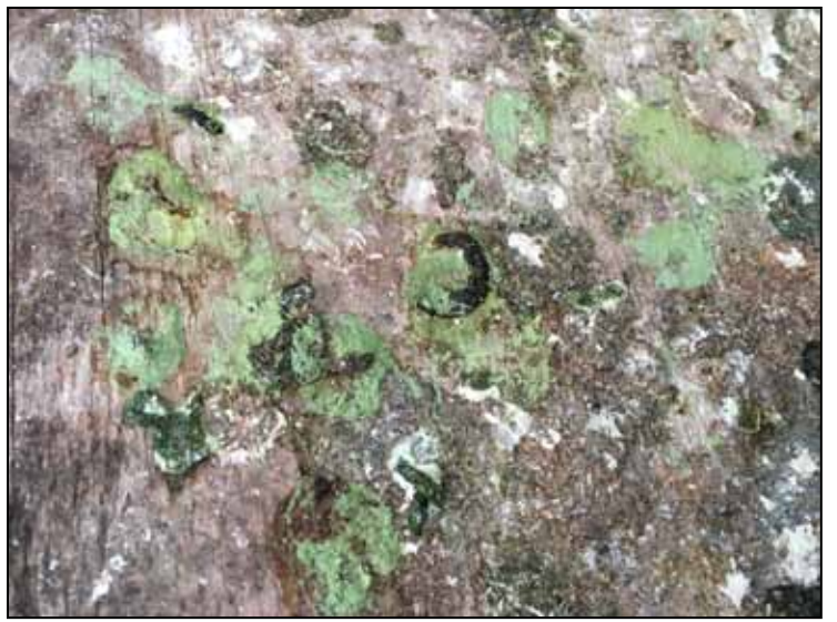
Typical green droppings of birds with Coccidiosis. Or . . . you forgot to feed your birds!

I don't know how many of you out there look at your bird poop! Now don't laugh! I look at it every day when I feed the birds. The droppings are a window to their health. The poop will tell you the health of your birds and allow you to jump into action if it does not look right. It should be a medium green to dark green/black color with a white spot in it. If it's a light green or very wet you have problems. Those of you that have deep litter that has been there for a while will have difficulties seeing the problems.